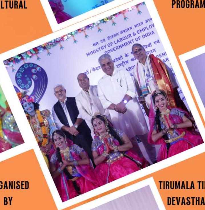
TIRUMALA TIRUPATI DEVASTHANAM