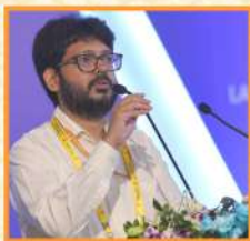
Shri. Rupesh Kumar Thakur Director, Ministry of Labour and Employment

Framing of rules under newly enacted four Labour Codes and modalities for effective implementation