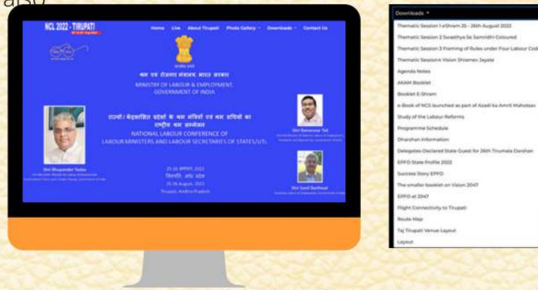
Documents available for download

It offered the convenience to the dignitaries as they could access the information they need anytime-anywhere even from the comfort of their own home also.