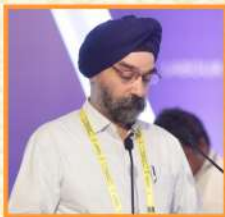
Shri. Mukhmeet S. Bhatia, Director General, ESIC

Integrating e-Shram portal for onboarding social security schemes run by Central Government & State Governments to universalize social protection to workers and to improve employment opportunities for all