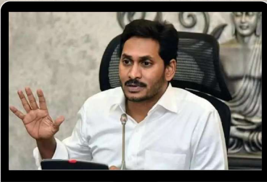
Shri YS Jagan Mohan Reddy, CM Andhra Pradesh

Addressing the valedictory session of the Conference virtually, Shri YS Jagan Mohan Reddy, CM Andhra Pradesh said that decisions taken at the conference might help in designing and strengthening labour laws for benefiting both industrialists and labourers.