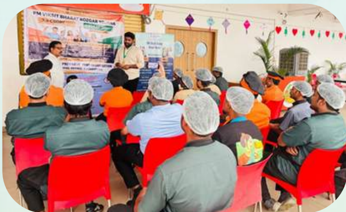
Regional Office Barkatpura