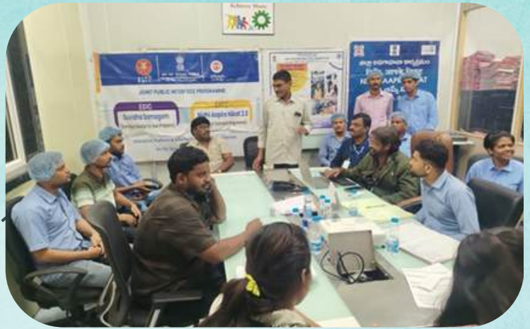
Regional Office Sangareddy

Nidhi Aapke Nikat 2.0 is a monthly district outreach program of EPFO, commenced in January 2023. Under this program, district camps are organized on the 27th of every month, or on the next working day if 27th is a holiday, to provide various on-the-spot services to members, such as e-nomination filing, KYC seeding, and claim-related services. It enhances EPFO's accessibility and visibility across all districts.