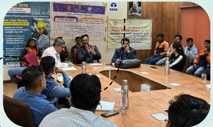
Regional Office Keonjhar