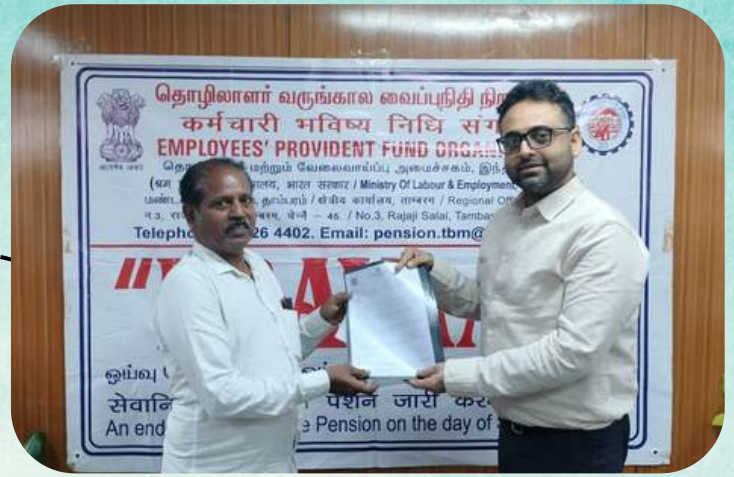
Regional Office Tambaram

EPFO ensures pension disbursement under Employees' Pension Scheme 1995 , which include vulnerable sections like senior citizens, women, children and orphans. Under the ' Prayaas ' initiative, field offices of EPFO are handing over PPOs to members of EPS 1995 on the day of their superannuation.