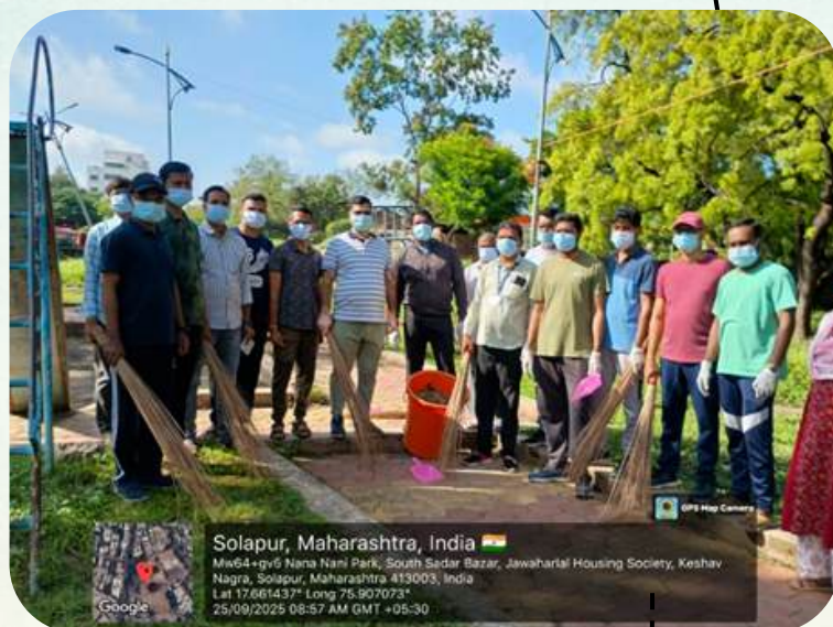
Regional Office Solapur

Central Vigilance Commission (CVC) in its initiative to fight against corruption has launched a 3-month campaign from 18th August to 17th November 2024 on the theme of "Our Shared Responsibility" . During the awareness campaign, Vigilance Awareness Week (VAW) was celebrated from 27th October to 2nd November 2025 .