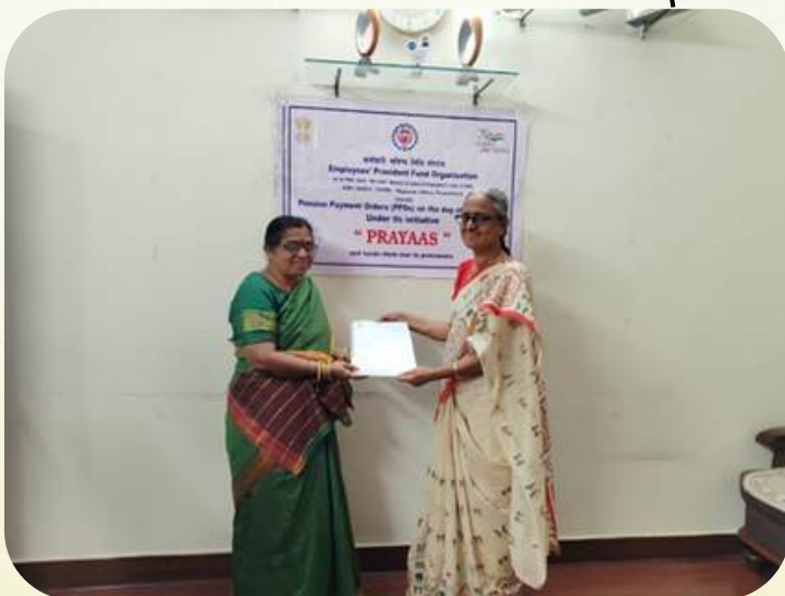
Regional Office Patancheru

EPFO observed the Swachhata Hi Sewa (SHS) Campaign, 2025 from 14.09.2025 to 01.10.2025 , as 2nd October (Gandhi Jayanti) every year is observed as Swachh Bharat Diwas. For this campaign, a committee at field office level was headed by office In-charge to formulate and recommend action plan on monthly basis for swachhata related activities in their respective field offices, zonal offices and residential areas.