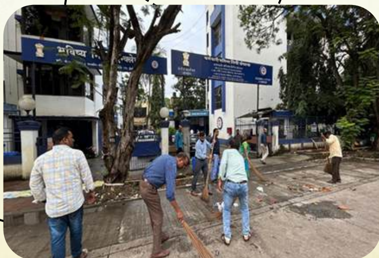
Regional Office Kandivali (West)