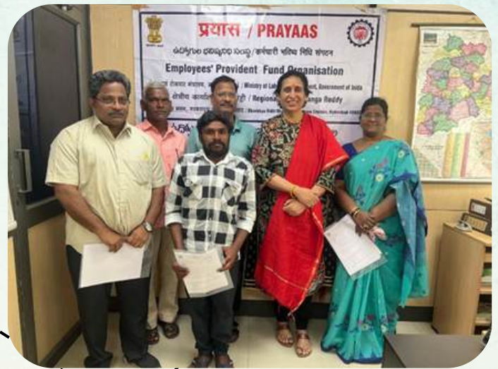
Regional Office Rangareddy