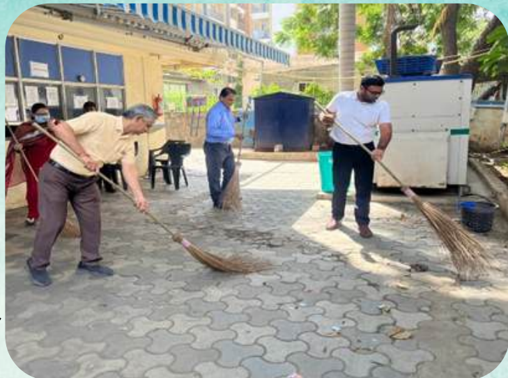
Regional Office Rajkot