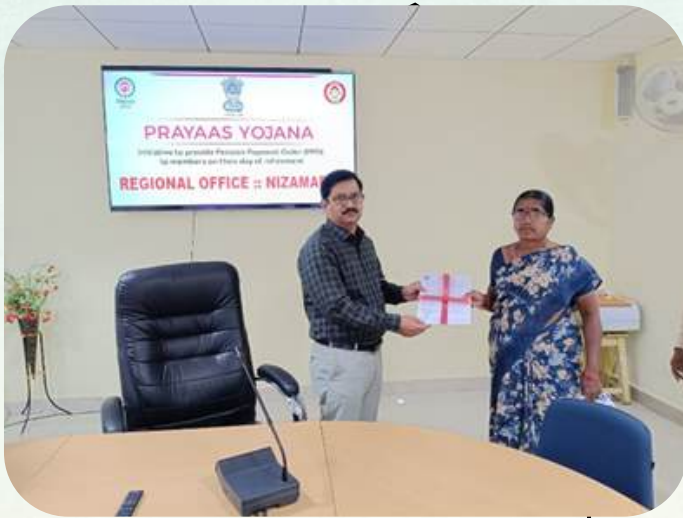
Regional Office Nizamabad