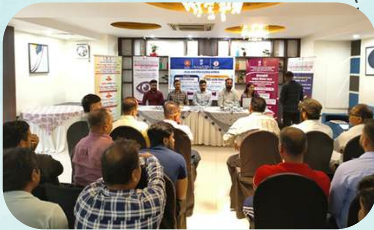
Regional Office Jalandhar