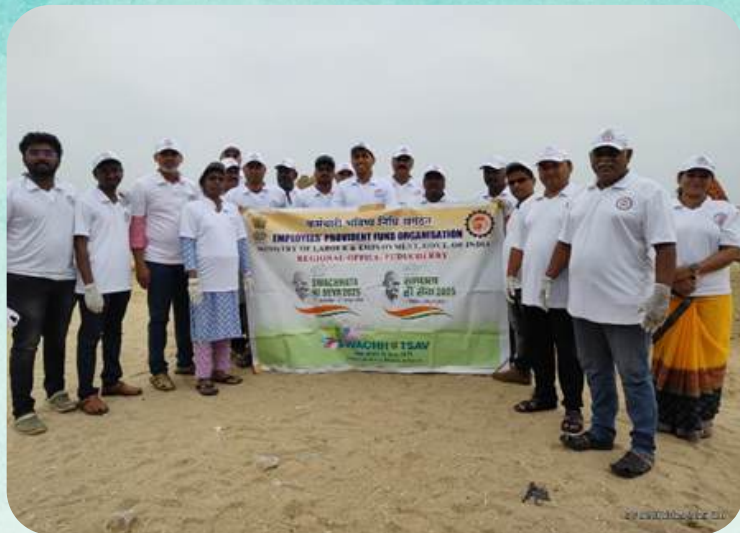
Regional Office Puducherry